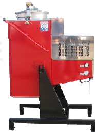
Si/Di60A 60 litre