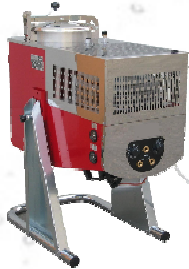
Si/Di30A 30 litre