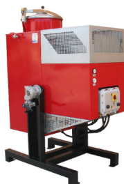
Si/Di160A 160 litre

The Standard Distatic models are available in non-flammable (S series) and flammable (D series ATEX Certified) versions with copper or stainless steel condensers. The standard distillers use air cooled condensers but water cooled versions are available as a no cost option in most cases.