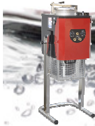
Si/Di15A 15 litre

With 35,000 units installed worldwide you can be sure that there is a unit working in a similar application to yours. Many of the worlds leading companies can testify to the quality, reliability and cost effectiveness of the equipment..