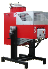
Si/Di120A 120 litre